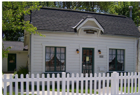
Weston Public Library

Summer Reading is a free program , and children ages preschool and up are welcome to participate. Stop by the library to pick up a reading log and calendar of events. All programs, except for the June 13 juggler, will be at 1:00 pm on Fridays in the Weston Park .